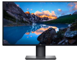
DELL ULTRASHARP 27 4K USB-C MONITOR | U2720Q

Designed to work seamlessly across 3 devices, this compact keyboard mouse combo keeps your desk clutter-free and lets you stay productive with up to 36 months 25 of battery life.