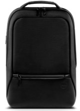
DELL PREMIER SLIM BACKPACK 15 | PE1520PS

Compact and portable 7-in-1 USB-C mobile adapter provides superb video, data connectivity and up to 90W power pass-through to your PC.