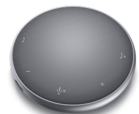
DELL MOBILE ADAPTER SPEAKERPHONE | MH3021P

Experience captivating details and true-to-life color reproduction on this brilliant 27" 4K monitor with a wide color coverage.